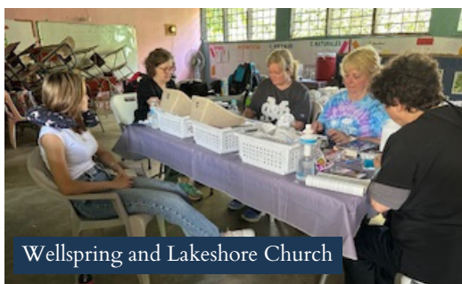
Wellspring and Lakeshore Church