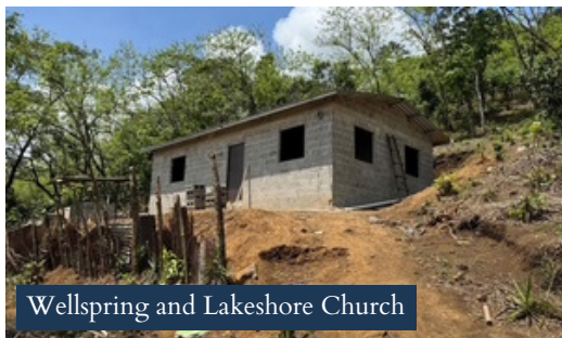
Wellspring and Lakeshore Church